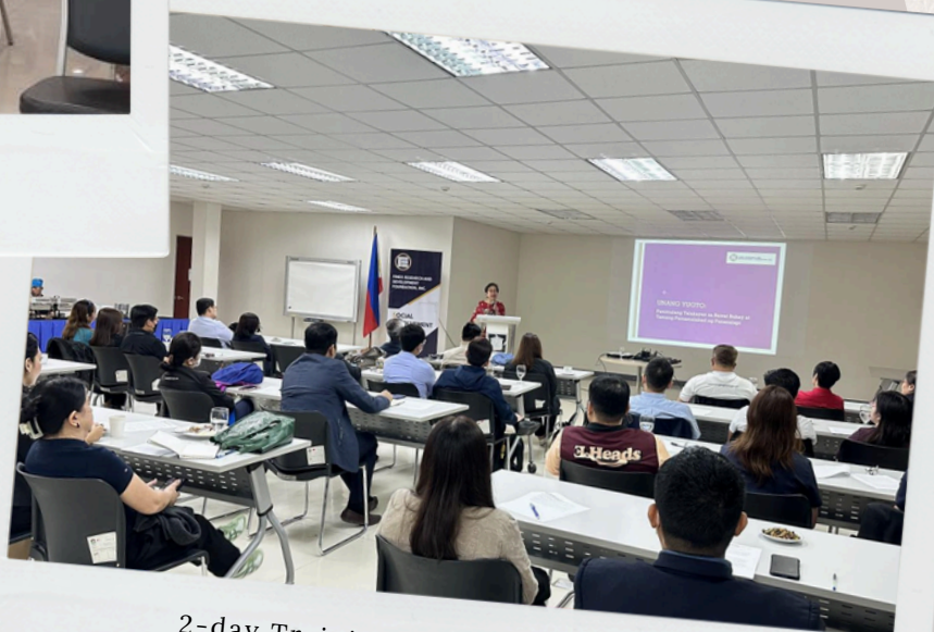
2-day Training of Trainer for Pag-ibig Fund officers. Check out photos HERE .

Several financial literacy sessions were held in the last quarter of the year including the Training of Trainer in relation to the roll-out of the financial literacy program to Pag-ibig Fund beneficiaries.