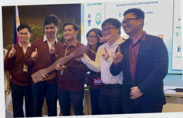
University of the Philippines - Diliman

ICFC is the country's most prestigious academic competition for college students in finance, banking, and economics. It is organized by the JFINEX Committee of the FINEX Foundation.