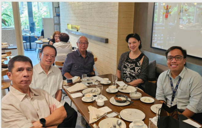
Programs & Meetings