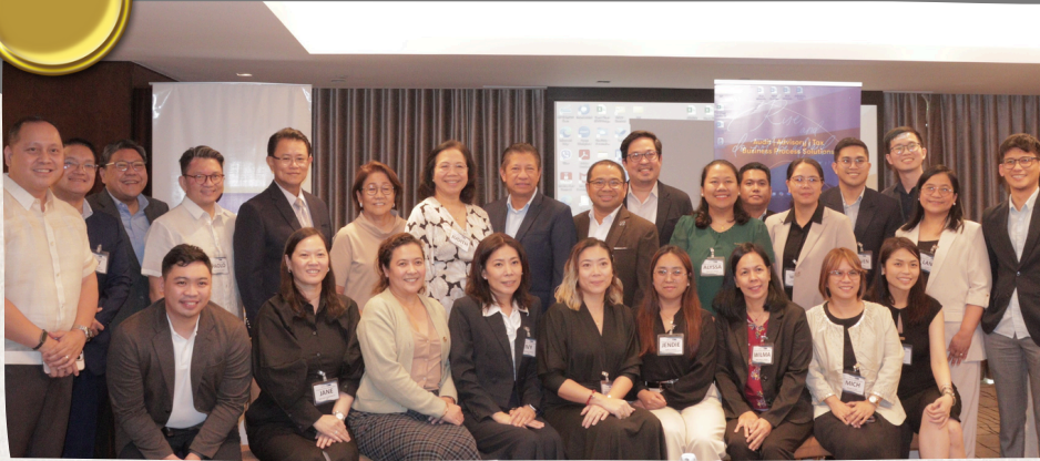
Graduation of the 2nd P&A Grant Thornton-FINEX Academy Executive Finance Leadership Program, November 21, 2024, at New World Makati Hotel