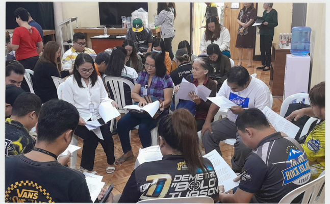
ARMSCOR employees. Check out photos HERE .