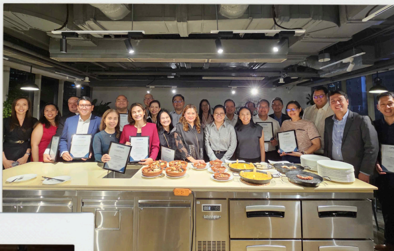
Young Finance Officers