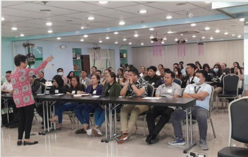
2-day session for ASA Philippines Foundation employees. Check out the photos HERE .

Several financial literacy sessions were held in the last quarter of the year including the Training of Trainer in relation to the roll-out of the financial literacy program to Pag-ibig Fund beneficiaries.