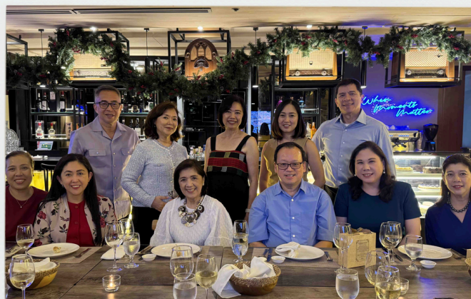
Arts & Culture