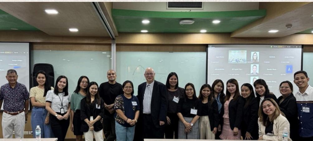
Day 3 of the 12nd Capital Markets & Fixed Income Securities Course (Course 2) – November 23, 2024, at SGV