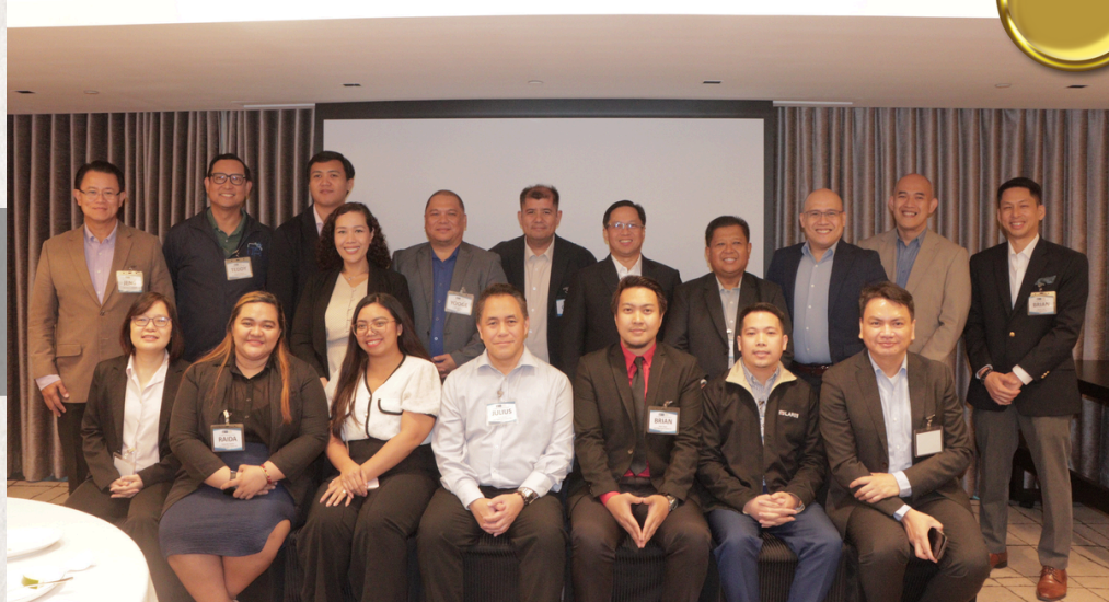
Marking Milestones: Graduation of the 1st Digital Transformation Program, November 28, 2024, at New World Makati Hotel