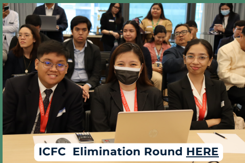
ICFC Elimination Round HERE