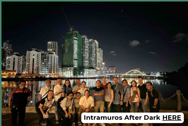
Intramuros After Dark HERE