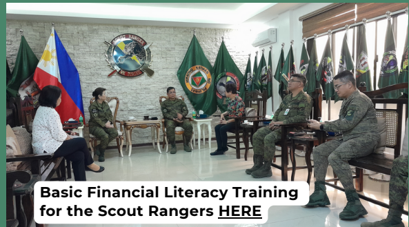
Basic Financial Literacy Training for the Scout Rangers HERE