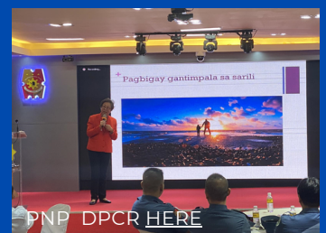
PNP DPCR HERE