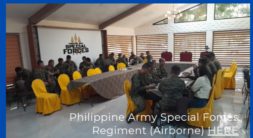
Philippine Army Special Forces Regiment (Airborne) HERE

Social Involvement Committee conducts Financial Literacy Trainings: