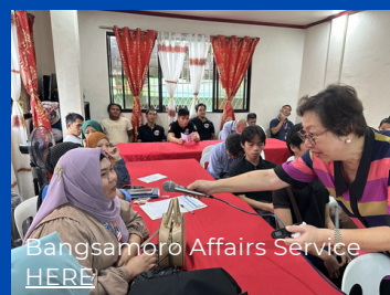
Bangsamoro Affairs Service HERE

Members always look forward to FINEX Night where they unwind and fellowship with other FINEX members with good food, wine and live entertainment.