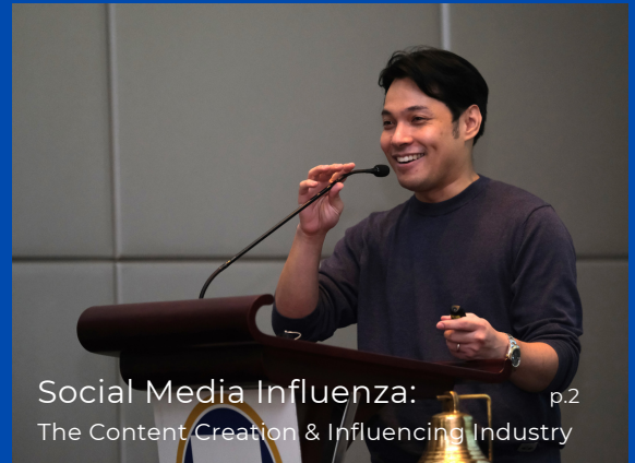
Social Media Influencer: p.2 The Content Creation & Influencing Industry