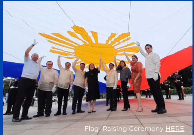
Flag Raising Ceremony HERE

Virtual sessions were also held from October 2-4 on different topics under the theme "Navigating Global Uncertainties Toward Sustainable Growth"