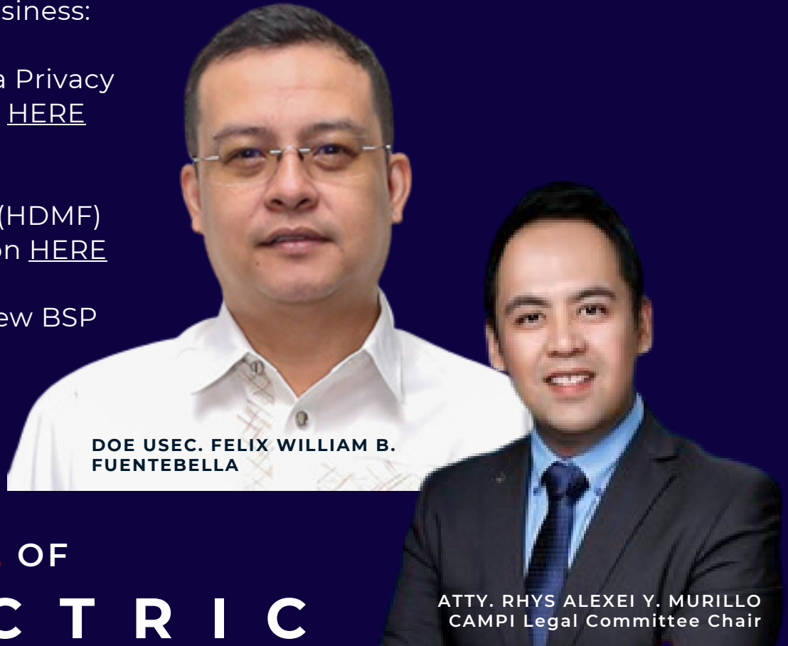
DOE USEC. FELIX WILLIAM B. FUENTEBELLA