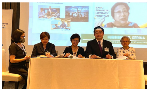
FINEX Foundation signs MOA with partner organizations <u>here</u>