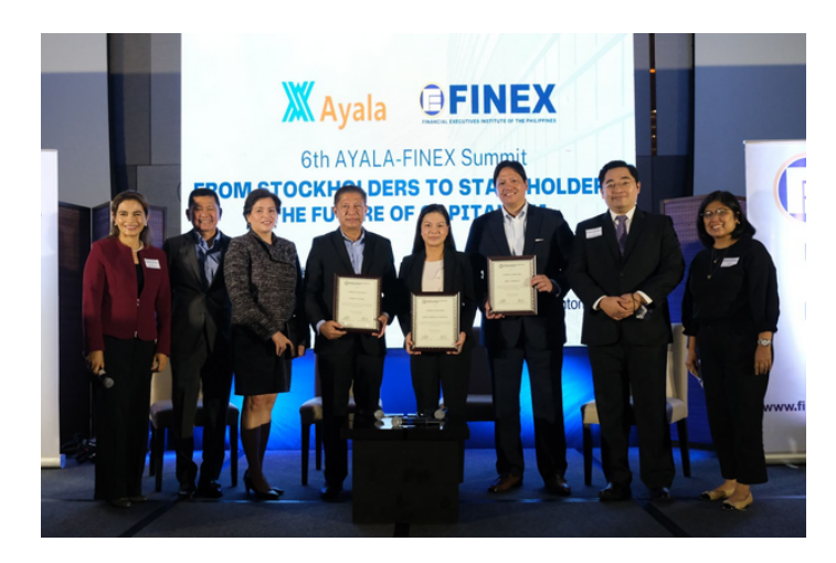
WATCH FULL VIDEO HERE STARTING AT < 3:10:28>.