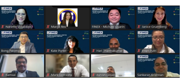
SaaS - Disruption through Technology Innovation here