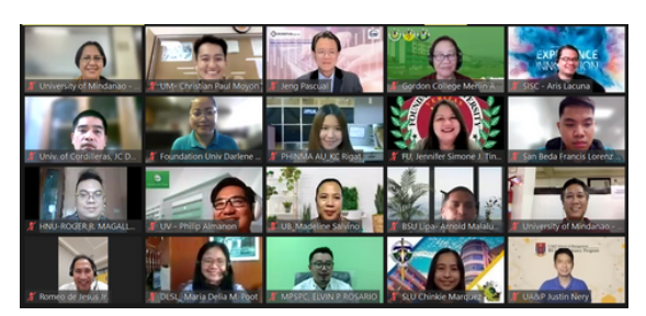
2022 Finance Educators Training Program here