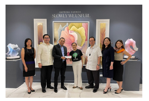
FINEX & Galerie Joaquin donation <u>here</u>