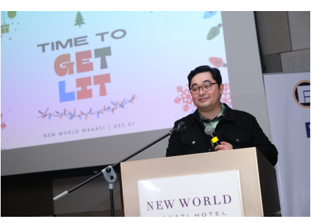
PRESIDENT'S CORNER p. 02