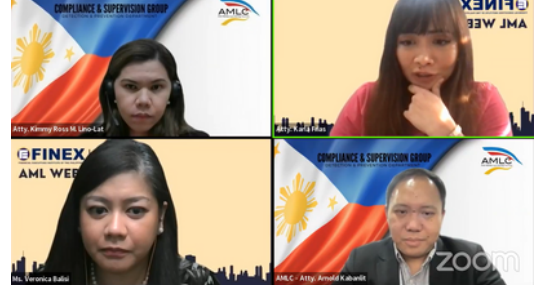
AML webinar here