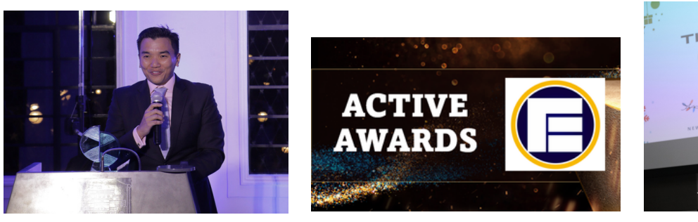
CFO of the Year Awards here