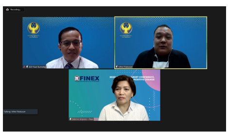
Dialogue with BSP: Addressing Digital Vote Buying <u>here</u>.