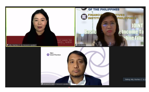
Basics and More: Income Tax Filing & SEC Online Filing To Dos <u>here</u>.