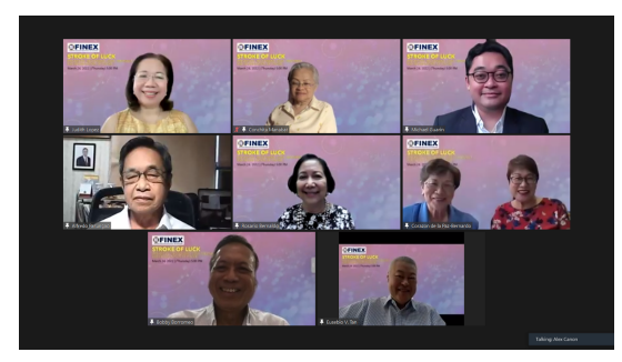
Stroke of Luck here.