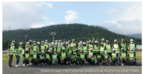
Ayala Group International Auditors at Alaminos Solar Plant