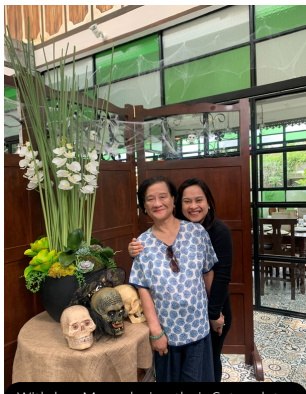
With her Mom during their Satur-dates