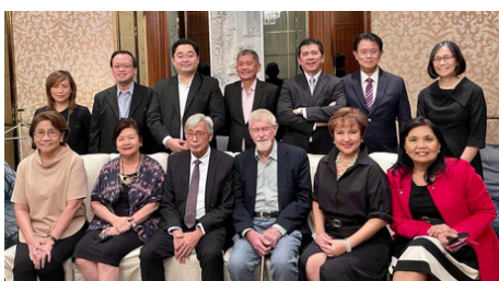
Dinner with BSP Governor Dr. Felipe Medalla here .