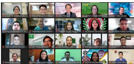
2022 Finance Educators Training Program here