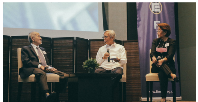
Special GMM with BSP Gov. Philip Medalla here