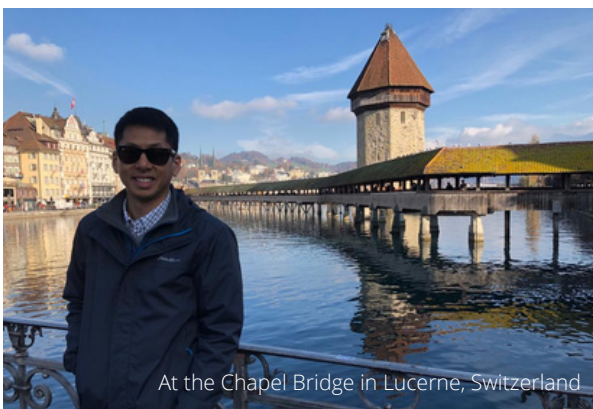
At the Chapel Bridge in Lucerne, Switzerland