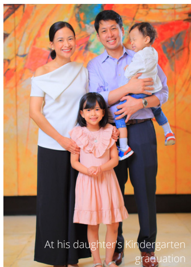
At his daughter's Kindergarten graduation

Prior to joining CCT, he worked in the IT industry abroad. He spent years selling IT solutions to federal, state, and local government and also education accounts. His last stint abroad was working for a boutique consulting firm located in Washington, DC that specialized in network infrastructure, data storage, virtualization, data center, wireless, and security solutions.