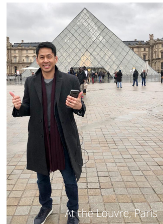
At the Louvre, Paris