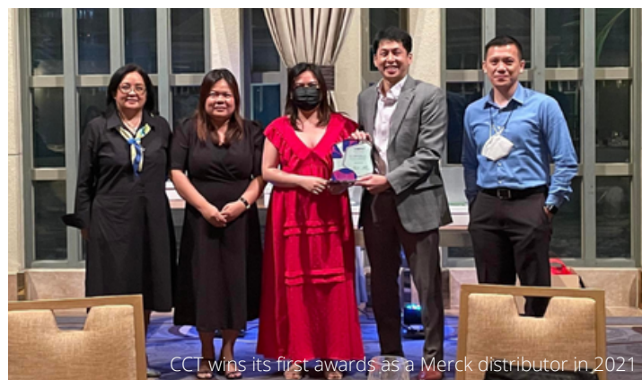
CCT wins its first awards as a Merck distributor in 2021