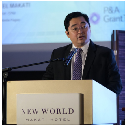
PRESIDENT'S CORNER p. 04