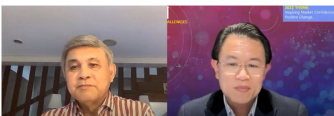
The Icons' Life Stories and Challenges of the Pandemic here