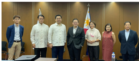
SEC Courtesy Call here .