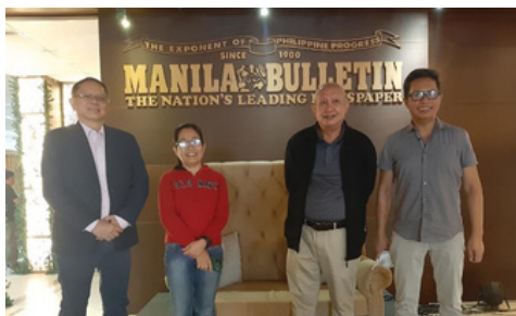
Courtesy call to Manila Bulletin here .