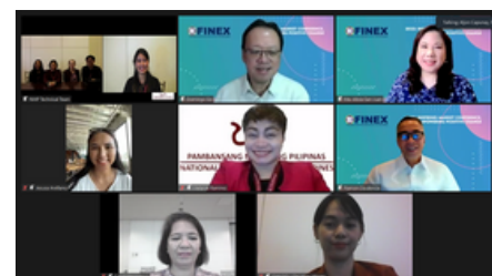
An Afternoon at the Museum here .