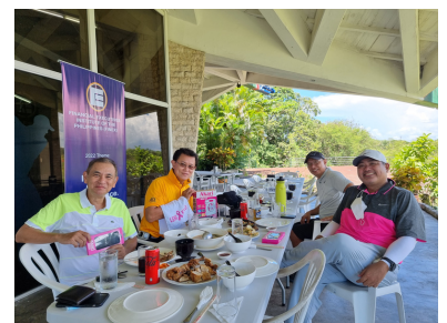
Golf Kick-off game here .