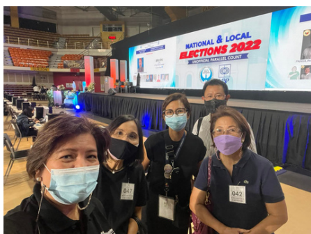
FINEX goes to PPCRV Command Center here .