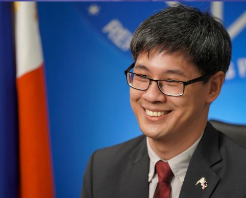
SEC. KARL KENDRICK T. CHUA p. 03